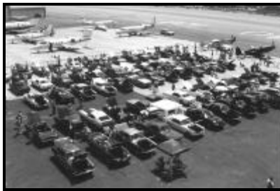
Photos From our Mustang Wings & Wheels Expo 2000

*Must be at event by 8:30 am for photo op